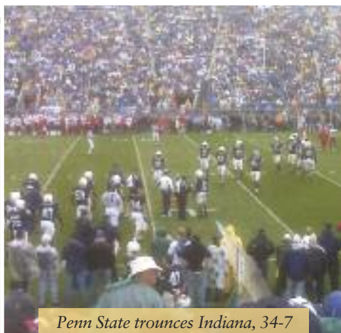
Penn State trounces Indiana, 34-7