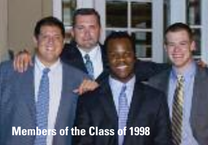
Members of the Class of 1998